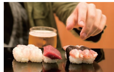
Eat sushi with the fingers