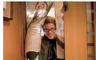
Pass through the NOREN curtain

Date June 15 (fri), 2018 Time 16:30-17:50 (reception from 16:00) Place IPPEI SUSHI 1-5-29, Katamachi, Kanazawa (See Map) Fee ¥3,000 (8 pieces of sushi, English guide, Tax included) Capacity 10 people (Reservations are made on a first-come, first-served basis.) *Children under the age of 15 are not permitted to join.