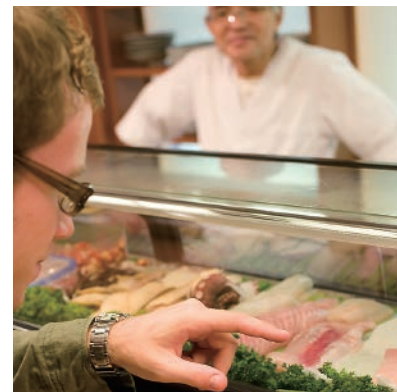
Order sushi from the glass case