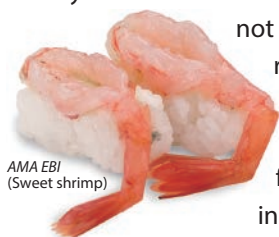
AMA EBI (Sweet shrimp)

Have you ever been the Japanese traditional Sushi Bar, not the conveyor-belt sushi restaurant? We offer you the very first step to experience at Sushi bar with English explanation. Do you think it is difficult to order from various types of seafoods, which are beautifully contained in the case? English speaking guide will provide you some etiquette or common rules, which are accepted at any sushi bars all over Japan. You may be a "Sushi Bar expert" while eating tasty Sushi. The venue IPPEI SUSHI is popular, traditional style Sushi Bar.